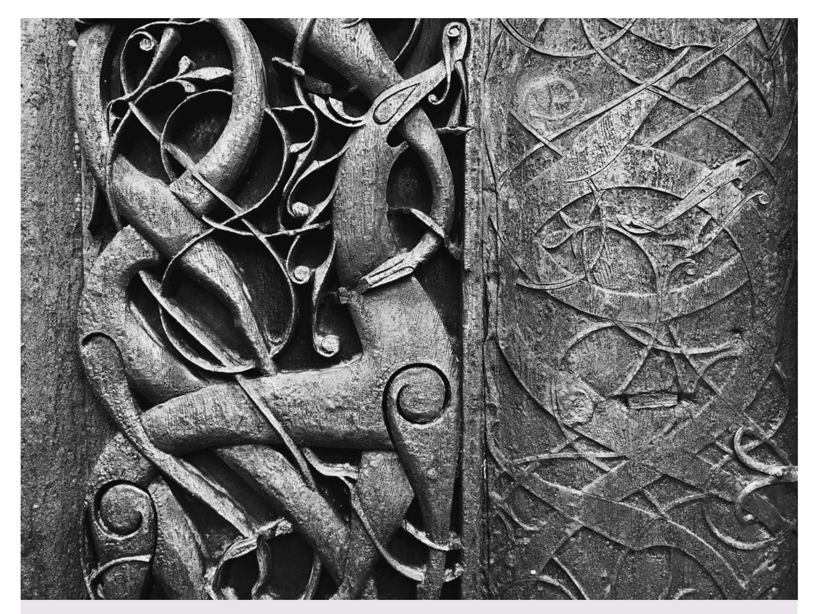
PANEL 3: MEDIEVAL CULTURE, RULERS, AND RELIGION, 6:30-7:40 PM

Timothy Clevenger, "Viking Influence in the UK"